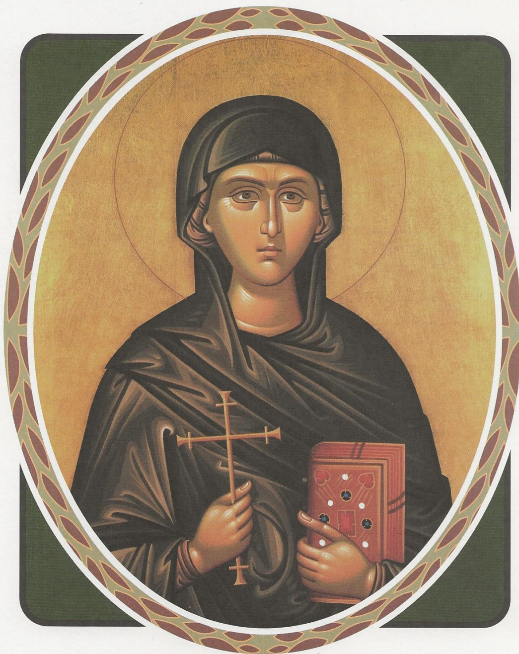
GREÆT MÆRTYR EUPHEMIA