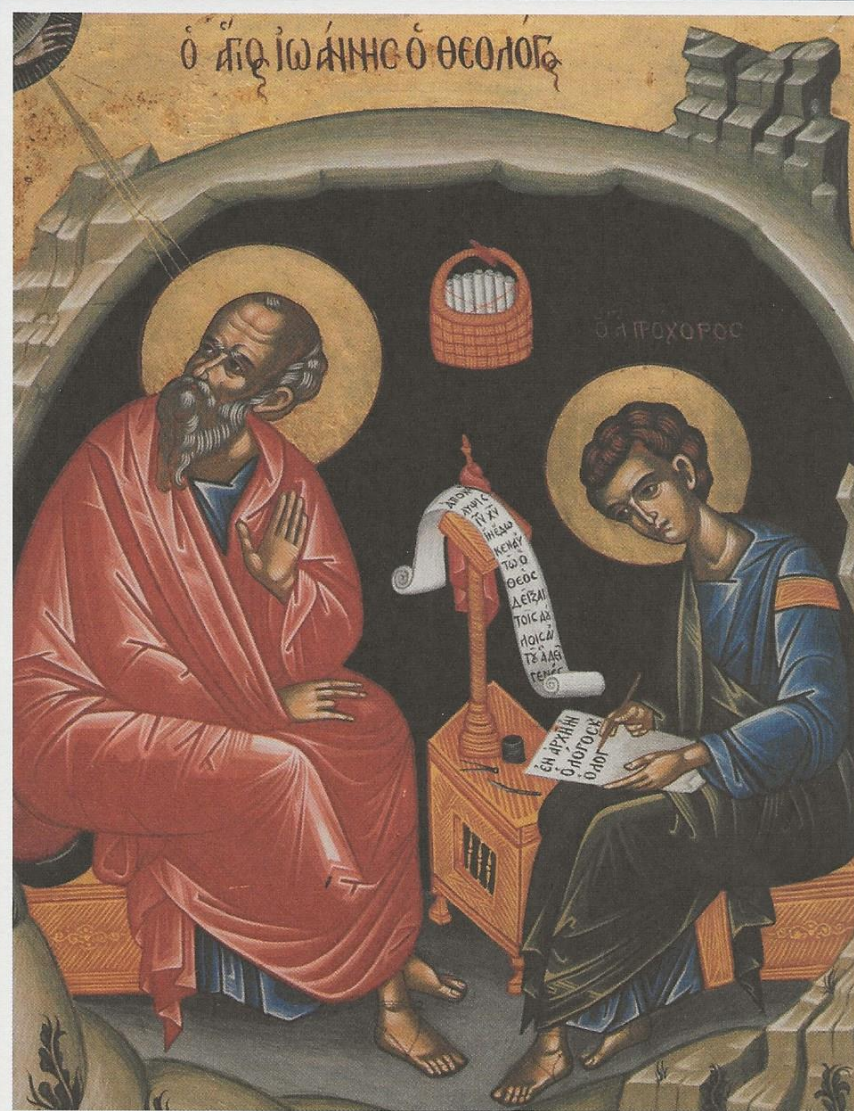
St. John the Theologian