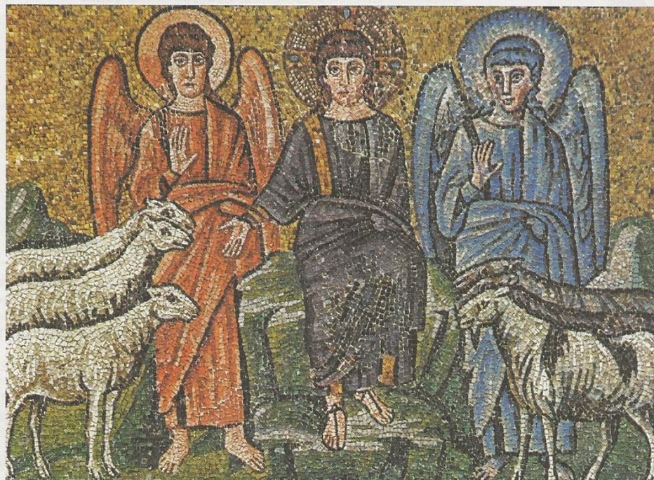
An Ancient Mosaic of the Last Judgment. Christ is enthroned, separating the sheep from the goats.